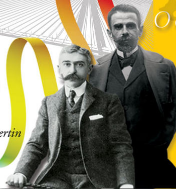
Pierre de Coubertin